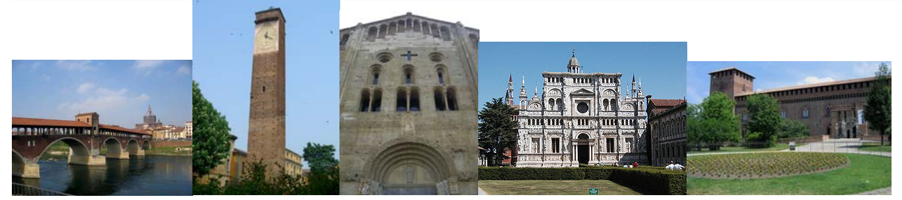
From right to left: the Old bridge on the Ticino river, the University clock tower, the St. Michael church, the monastery of Certosa of Pavia the castle

Pavia is the capital of a fertile province known for agricultural products including wine, rice, cereals, and dairy products. The province of Pavia is included in the Regional Park of the Ticino valley, Lombardy. In early September, during the day, the local weather is usually warm (≥ 20° C).