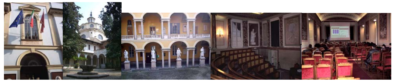
From right to left: the façade of the University, the inner garden, the inner courtyard, some lecture halls (Aula Volta and Aula Foscolo).

The Centrale Building of the University is a wide block made up of twelve courts from the 15th-19th centuries. The sober façade shifts from baroque style to neoclassic. The Big Staircase, the Aula Foscolo, the Aula Volta, the Aula Scarpa and the Aula Magna are neoclassic too. The Cortile degli Spiriti Magni hosts the statues of some of the most important scholars and alumni. Ancient burial monuments and gravestones of scholars of the XIV-XVI centuries are walled up in the Cortile Voltiano (most come from demolished churches). The Orto Botanico dell'Università di Pavia is the university's botanical garden.