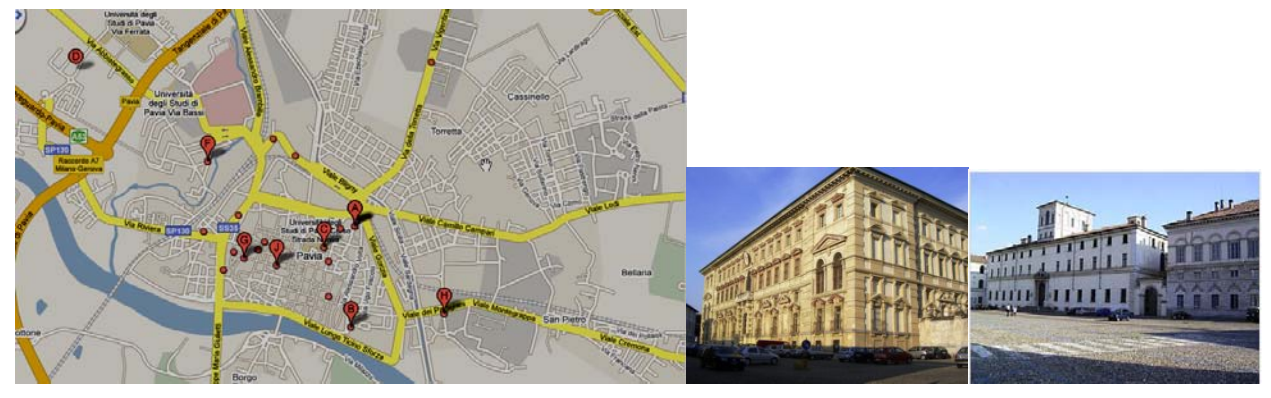
Location of the university colleges (photo: Borromeo and Ghislieri colleges)

Pavia has a good availability of university colleges, where the participants of the congress will find accommodation at a cheap price. The colleges are located in the city centre and close to the venue of the Colloquium. A complete list of the possibilities for accommodation (hotels, holiday farms, camping sites) and restaurants will be provided later.